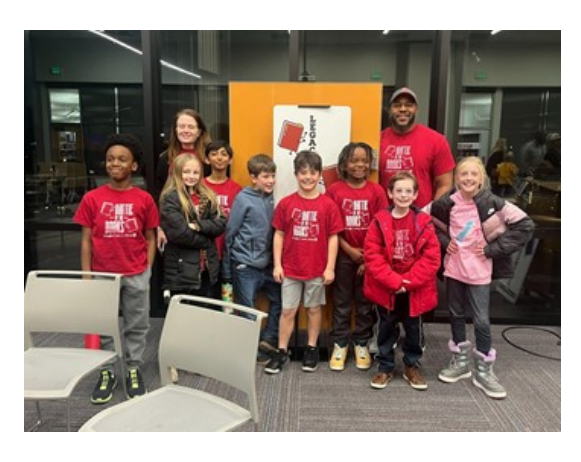
3rd/4th Grade Team

This is our first year for Battle of the Books at Legacy Point. It's a national competition where kids read the same 10 books, then battle it out with other schools in the district (and state!) by answering difficult questions found in the text. Our teams are off to a great start...stay tuned for more!